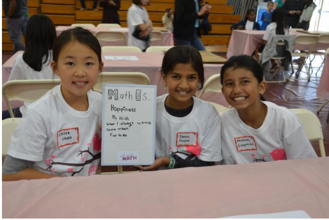
All Girls Math Tournament 2017